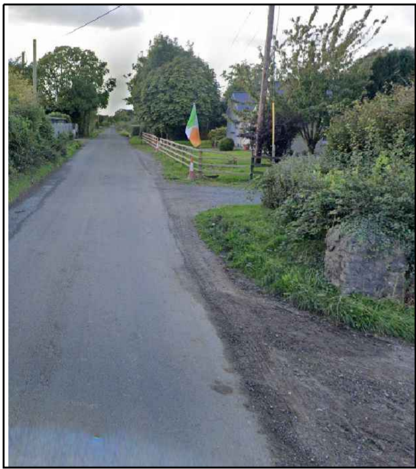
VIEW WEST FROM ENTRANCE

If Applicable : Ordnance Survey Ireland Licence No. EN 0001218 © Ordnance Survey Ireland and Government of Ireland OSI SHEETS 3122-C, 3122-D,3187-A,3187-B,3187-C,3187-D,3188-A,3188-B,3188-C,3188-D,3253-A,3253-B,3253-C,3253-D,