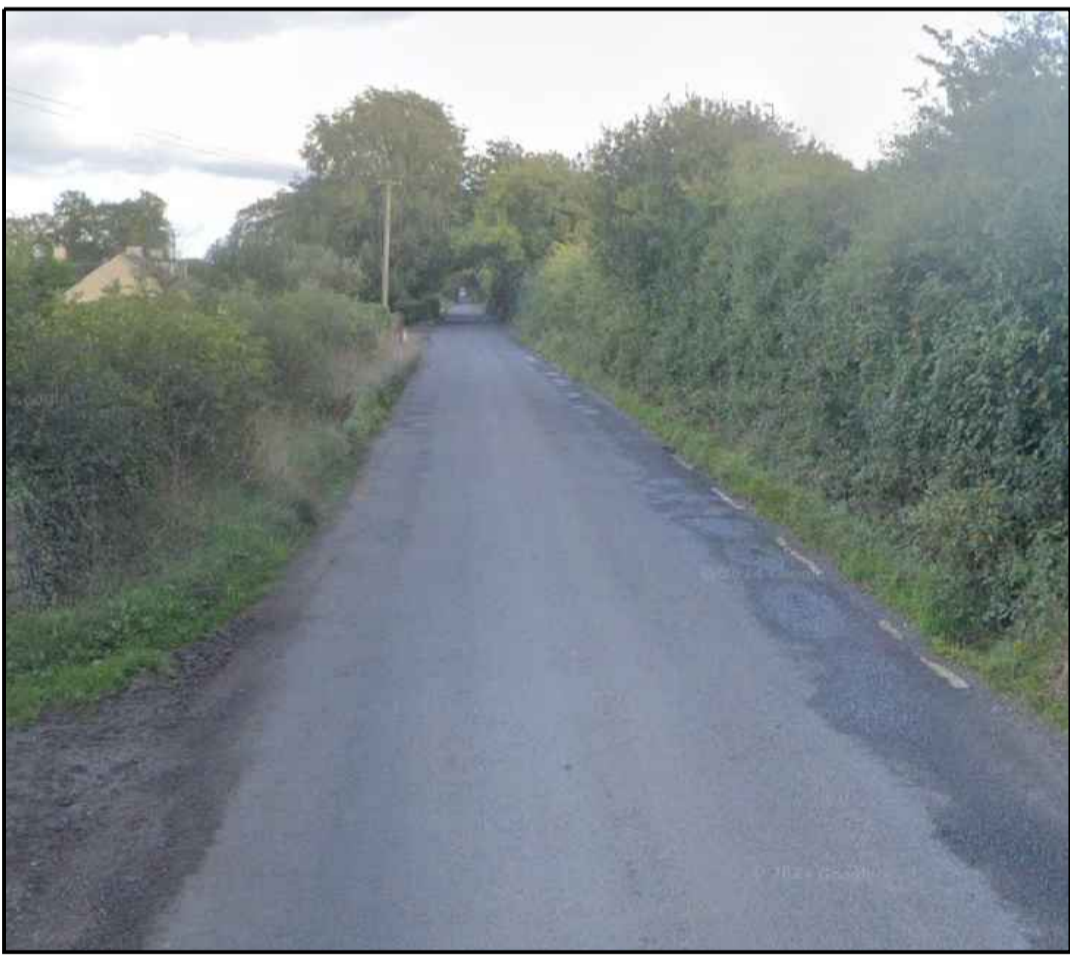
VIEW EAST FROM ENTRANCE